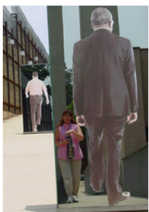
In quiet reflection among giants... Apartheid Museum, Johannesburg – Pretoria.