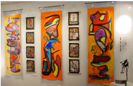
Dooleena, Rawlinna, Dillinya – Dreamspace Exhibited at Galerie Art & Miss, Paris. Acrylics, gouache, and Chinese ink on paper, 156x53cm

I grounded myself in real territories to give birth to a space of dreams – and to legendary heroines.