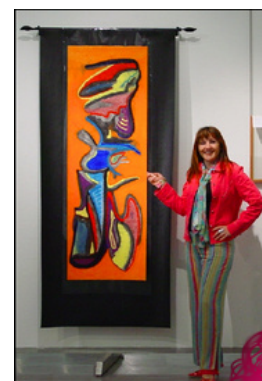
A moment of pride, of connection, of shared memory.