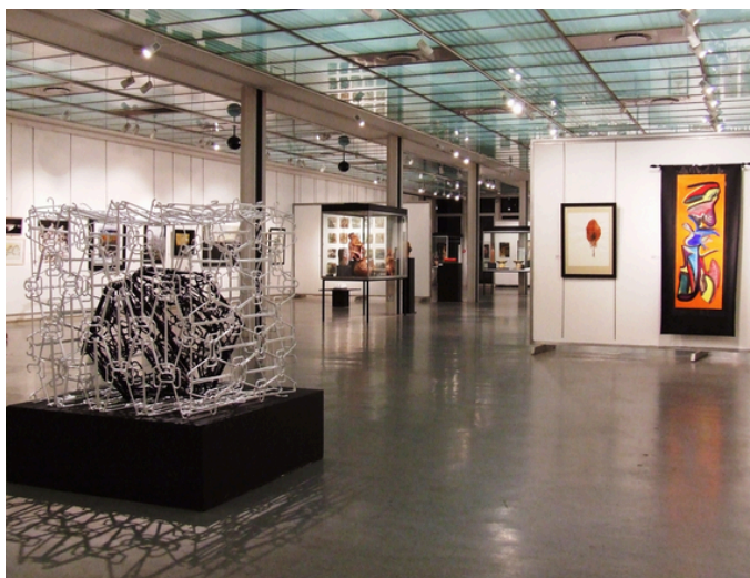
2007 – Contemporary Visions of Southern Africa Museum of Contemporary Art, Pretoria, South Africa

A space of resonance, a passage between worlds.