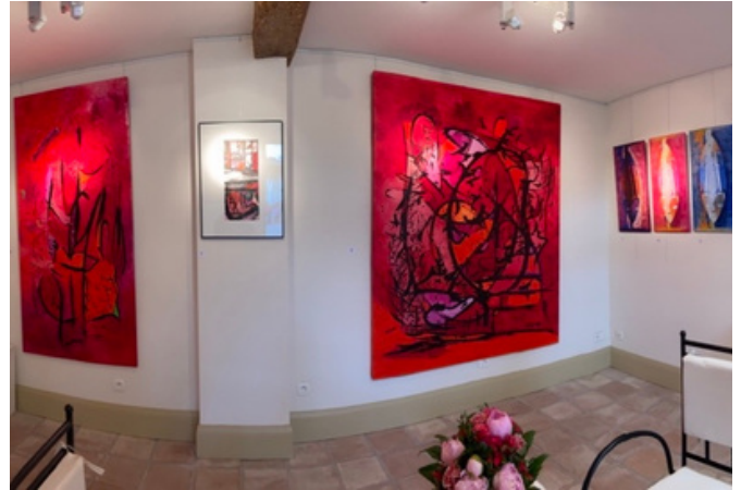
Exhibition Heart of Transhulance

"Look, you are here with me. We made it."