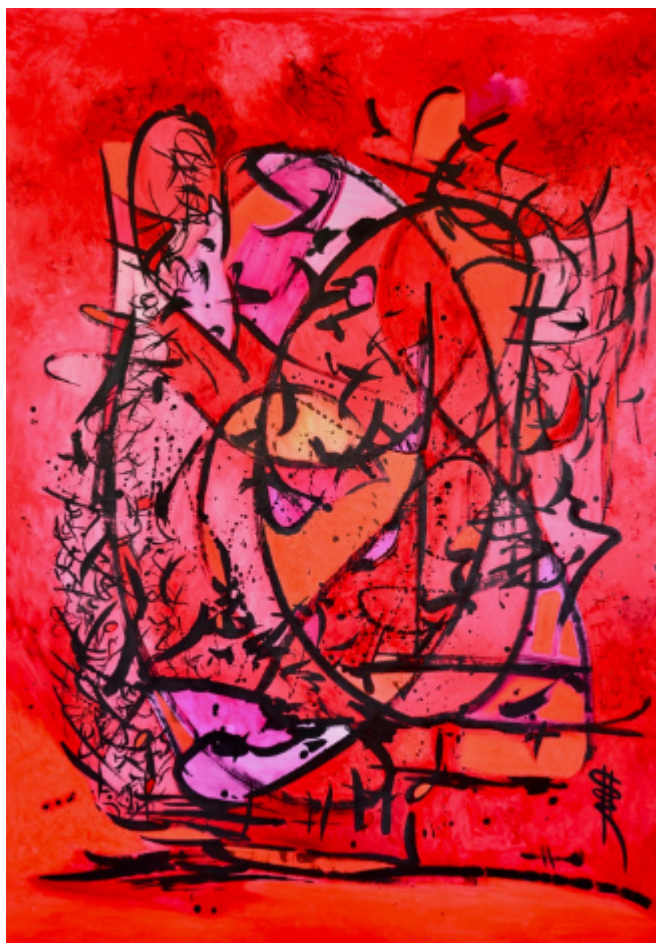
Old Lady —Red Transhumance Oil and Chinese ink on canvas, 210x150 cm

Today, I invite you to explore its origin, its connection with the calligraphic gesture, and to discover fragments of life that reveal the power of universal language in my creation.