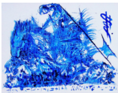
Guerrier Oil on paper, 30x45cm