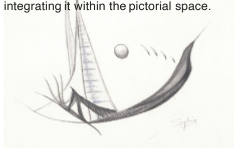
Rêverie II Pencil drawing, 29x21 cm

They reflect a transition: from asserting an identity to integrating it within the pictorial space.