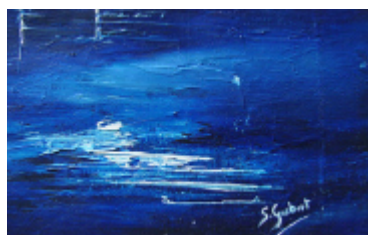
Phréatique Oil on canvas, 12.4x20cm