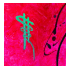
Examples of monogram